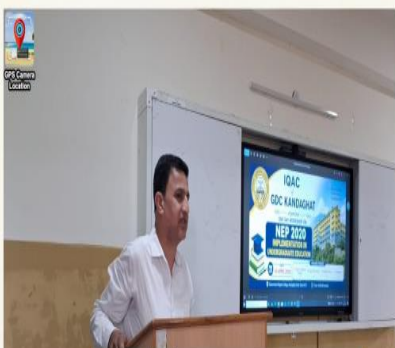
Baror Himachal Pradesh India 25°C X3JM+CQX, Baror, Himachal Pradesh 173215, India