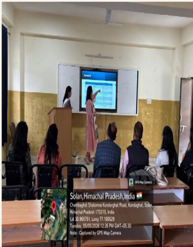
Solan, Himachal Pradesh, India Chandbaghat Shaloma Kandaghat Road, Kandaghat, Solan, Himachal Pradesh 173215, India Lat 30.965751, Long 77.100529 Tuesday, 05/05/2026 12:26 PM GMT+05:30 Note: Captured by GPS Map Camera