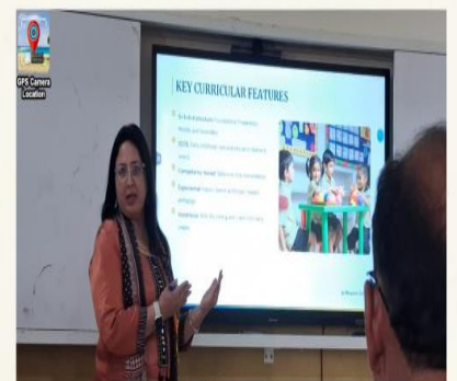
Kandaghat Himachal Pradesh India 25°C X482+645, Kandaghat, Himachal Pradesh 173215, India