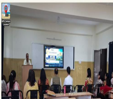
Kandaghat Himachal Pradesh India 25°C X484+93M, Kandaghat, Himachal Pradesh 173215, India