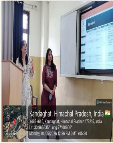
Kandaghat, Himachal Pradesh, India X482+645, Kandaghat, Himachal Pradesh 173215, India Lat 30.965635° Long 77.100606° Monday, 04/05/2026 12:36 PM GMT +05:30