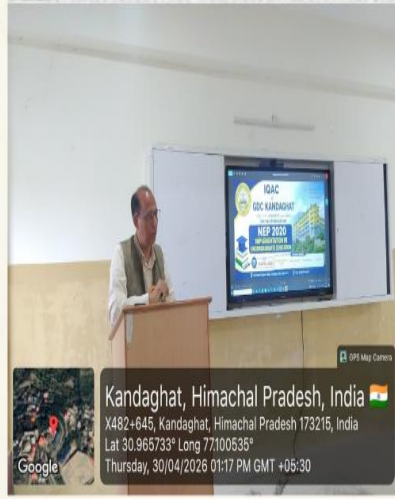
Kandaghat, Himachal Pradesh, India X482+645, Kandaghat, Himachal Pradesh 173215, India Lat 30.965733° Long 77.100535° Thursday, 30/04/2026 01:17 PM GMT +05:30