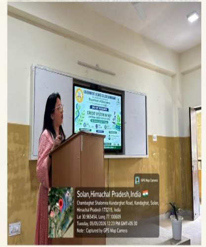
Solan, Himachal Pradesh, India Chandbaghat Shaloma Kandaghat Road, Kandaghat, Solan, Himachal Pradesh 173215, India Lat 30.965454, Long 77.100609 Tuesday, 05/05/2026 12:23 PM GMT+05:30 Note: Captured by GPS Map Camera